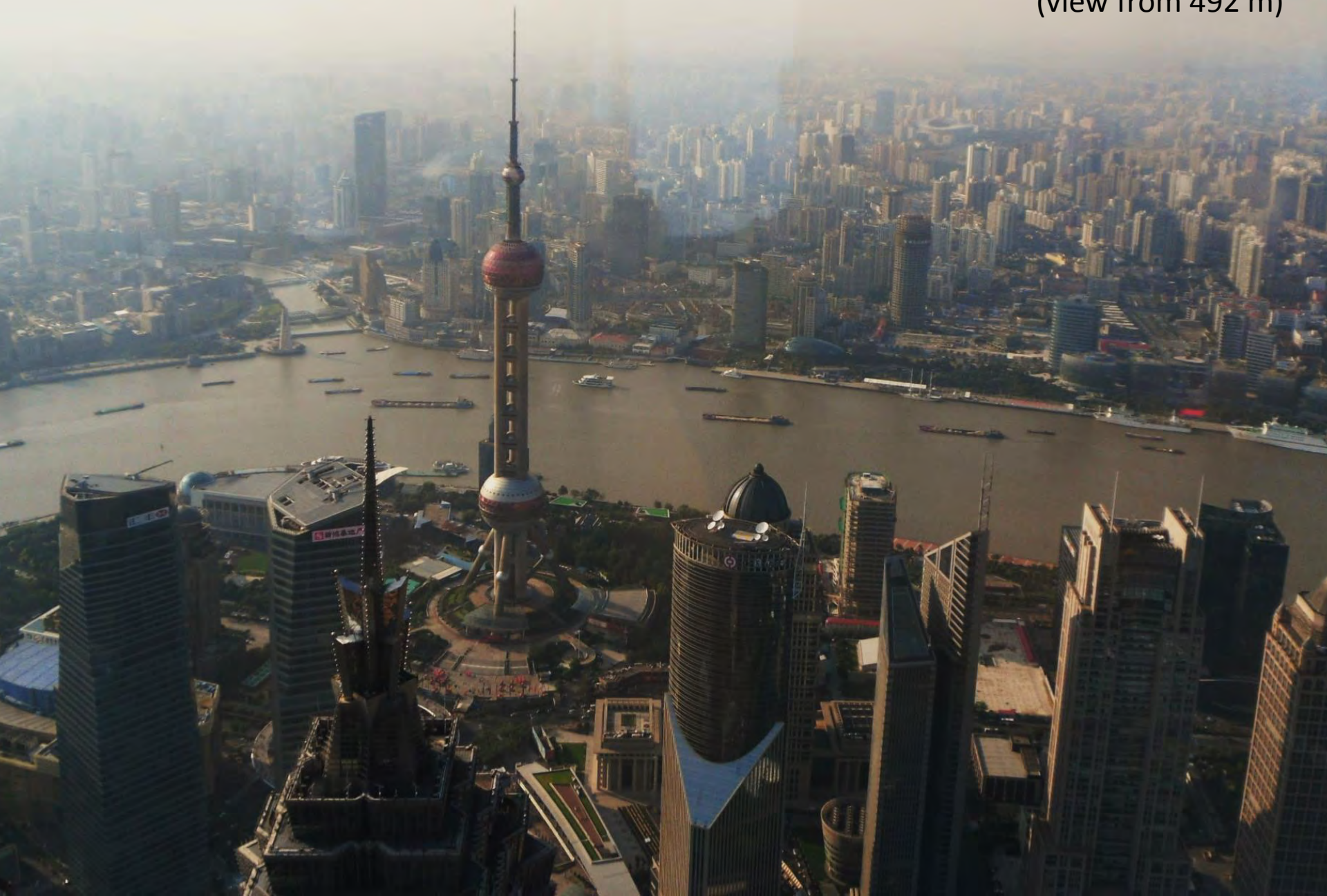
Downtown Shanghai (view from 492 m)